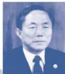
General Choi, Hong Hi Father of Taekwon-Do

Lao Zi sits with crossed legs on a stone stool, with his long grey hair bound at the back. His moustache and eyebrows are all white. Confucius stands with cap in hand showing great respect and modesty, with both hands folded together in front and bowing to Lao Zi.