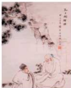
Confucius Asking Lao Zi about Etiquette

This story shows the importance we place on the Tenets and Protocols of Taekwon-Do. This guide describes some of Protocols necessary in various situations. Although not a definitive guide, this document will help you to better understand some of the ways we use Protocol to show respect, discipline and compassion to everyone.